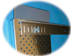
固定扣 fixing clip