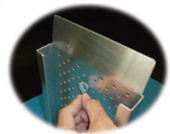
有槽連接扣 connecting clip with slot